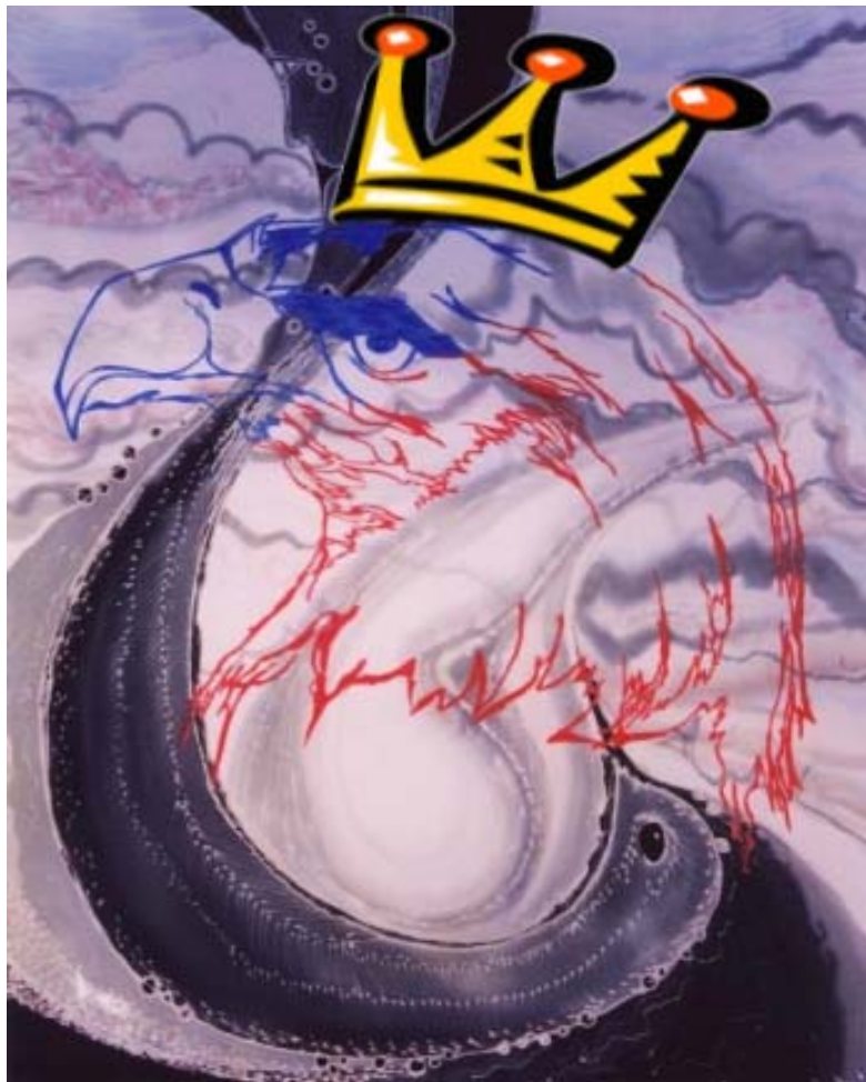
The Princess and the P.E.E.

Thus their heART opened to receive easily and forever happily a trust, a hearing, and a reliable and sexy vehicle to transcend the eternal joke, moment by moment!